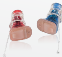
quiX with Mould