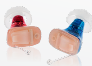
quiX with Dome